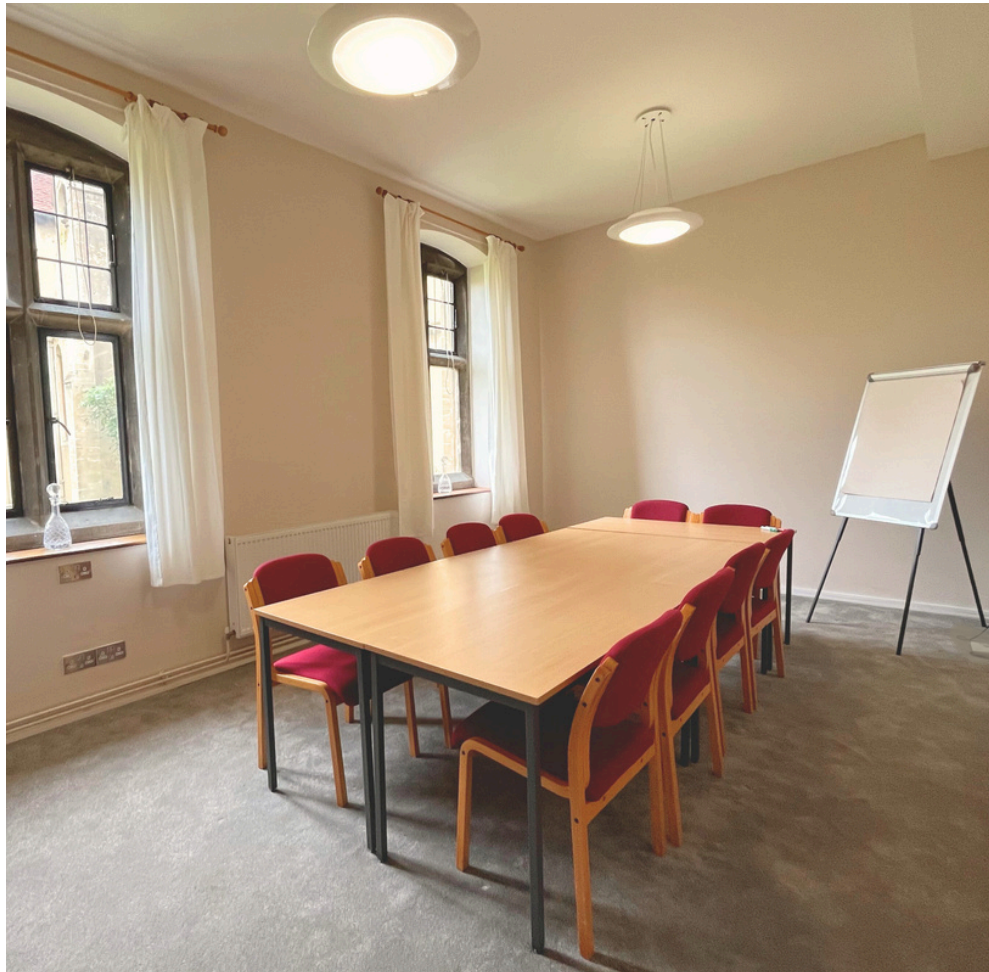
THE ROSS ROOM