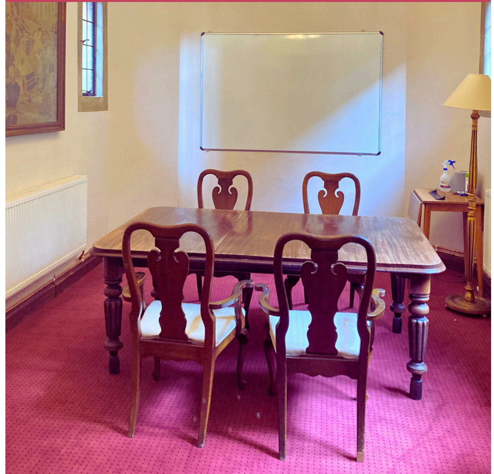
THE KEMP ROOM